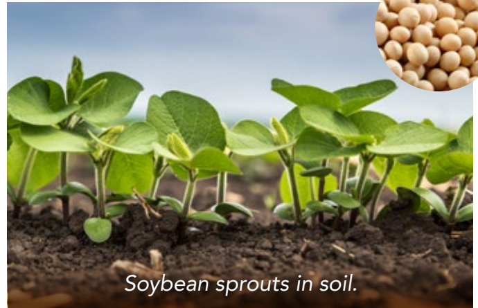
Soybean sprouts in soil.

Illinois has some of the best soil in the world. Most of our state's land is used to produce food. The main crops grown in Illinois are corn and soybeans.