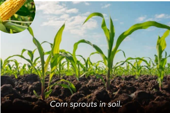
Corn sprouts in soil.