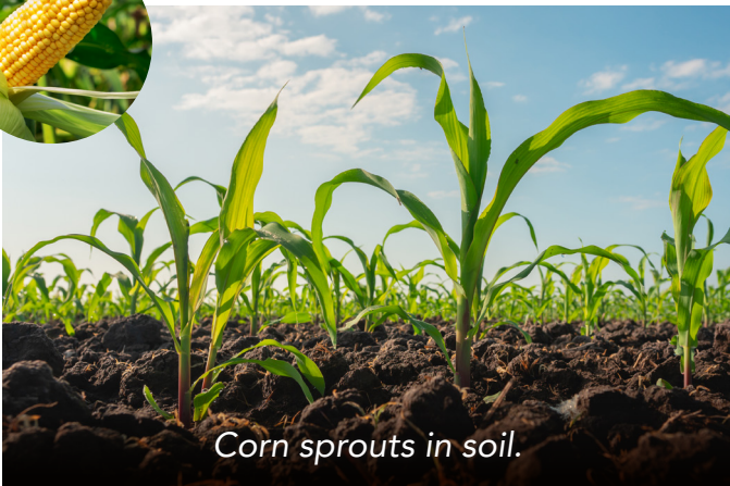
Corn sprouts in soil.