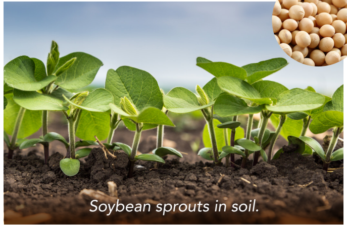
Soybean sprouts in soil.

Illinois has some of the best soil in the world. Most of our state's land is used to produce food. The main crops grown in Illinois are corn and soybeans.