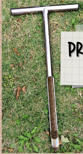
PROBES IN USE