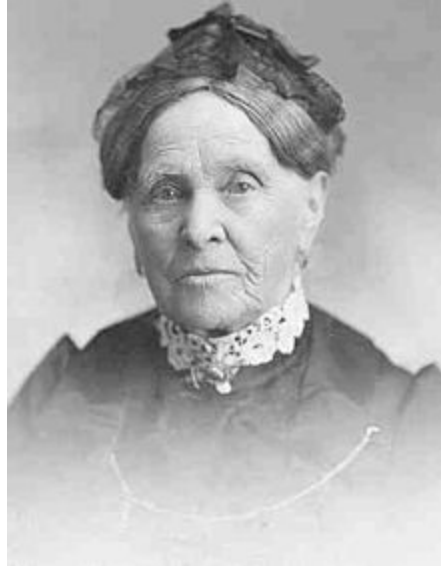
Lydia Moss Bradley

Born July 31, 1816 Vevay Indiana, before moving to Peoria Illinois in 1847. First female member of a national bank board (1875), First American woman to have a marriage contract to protect assets (prenuptial agreement), founded Illinois Park Systems and established Bradley University in 1896. Died January 16, 1908 in Peoria.