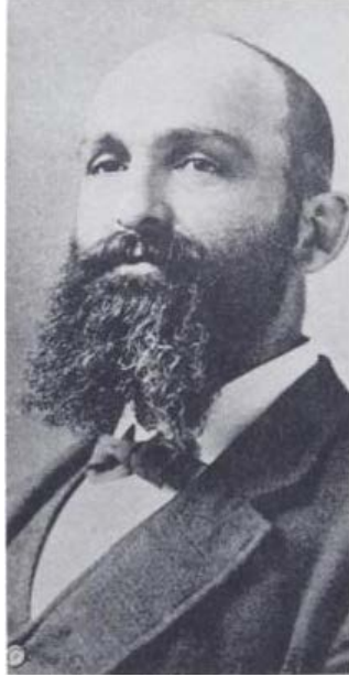
Whitcomb L. Judson

Born in Chicago, IL March 7, 1846. Served in the Union army with the Forty-Second Illinois Cavalry from 1861-1865. Attended Knox College in Galesburg, Illinois and in 1890 received a patent for a clasp locker fastening device. This was the precursor to the modern zipper. Judson dies December 7, 1909.